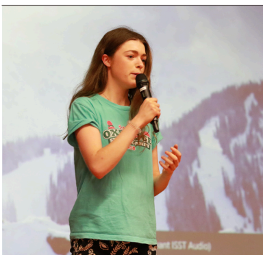
English Summer Camp