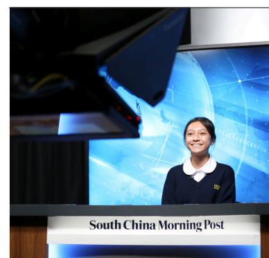
SCMP "Experience as an Anchor" Programme