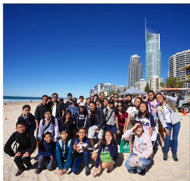
Study Tour to Australia