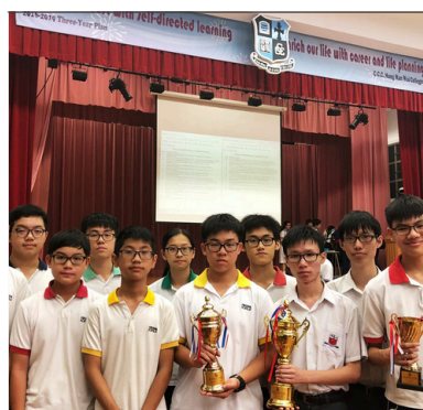
Inter-school Scrabble Championship