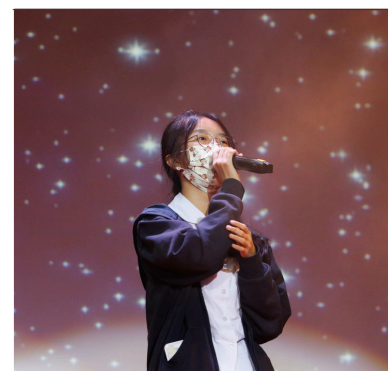
English Singing Contest