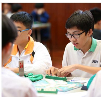
K S Lo Scrabble League